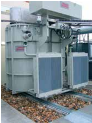
Stationary Oil Cooling for a power transforming plant, Bernard & Bonnefond