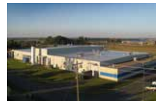
AKG North American Operations, Inc., Plant Mitchell, USA