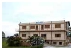
AKG do Brasil Ltd. Lorena - São Paulo, Brasil