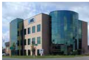
AKG of America, Inc. North American Operations, Inc., Plant Mebane, USA