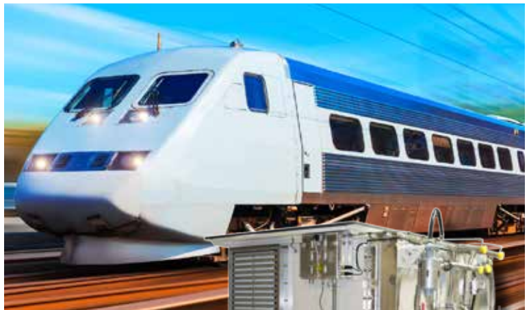
Cooling tower for combined cooler for transformer oil and coolant