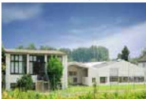
AKG Thermotechnik GmbH & Co. KG Hofgeismar, Germany