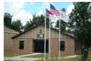
AKG Thermal Systems, Inc. Mebane, USA