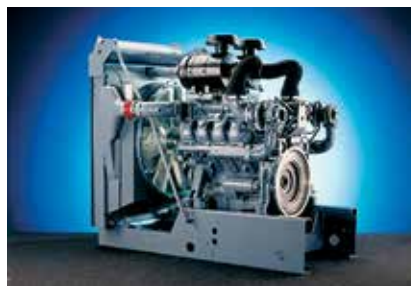
Coolant/Charge-Air Cooling Module for a stationary genset power pack, MAN