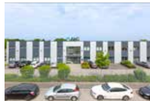
AKG Thermotechnik GmbH & Co. KG Dortmund, Germany