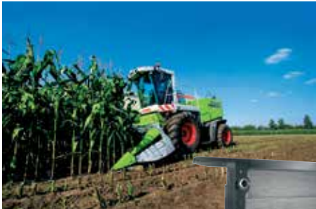
Combination Coolant/ Charge-Air and Oil Cooler for the „Jaguar 900“ Forage Harvesters, Claas