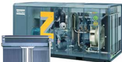
Oil free Screw Compressor 160 kW (ZT160) with Pre-, Inter- and After- Cooler for compressed air, Gear Oil-Cooler and Regeneration-Cooler, Atlas Copco