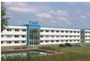
SIA AKG Thermotechnik Lettland Jelgava, Latvia