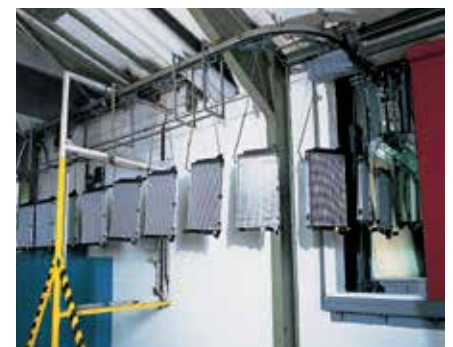
Electrostatic paint line