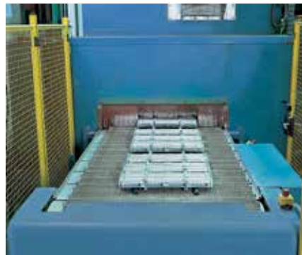
CAB brazing furnace