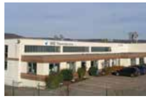
AKG Thermotechnik GmbH & Co. KG Uslar, Germany