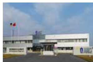
AKG Thermal Systems (Taicang) Co., Ltd., Taicang, China