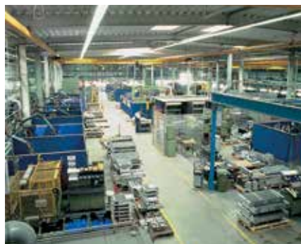
Heat exchanger final assembly