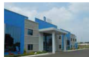
AKG India Private Limited Coimbatore, India