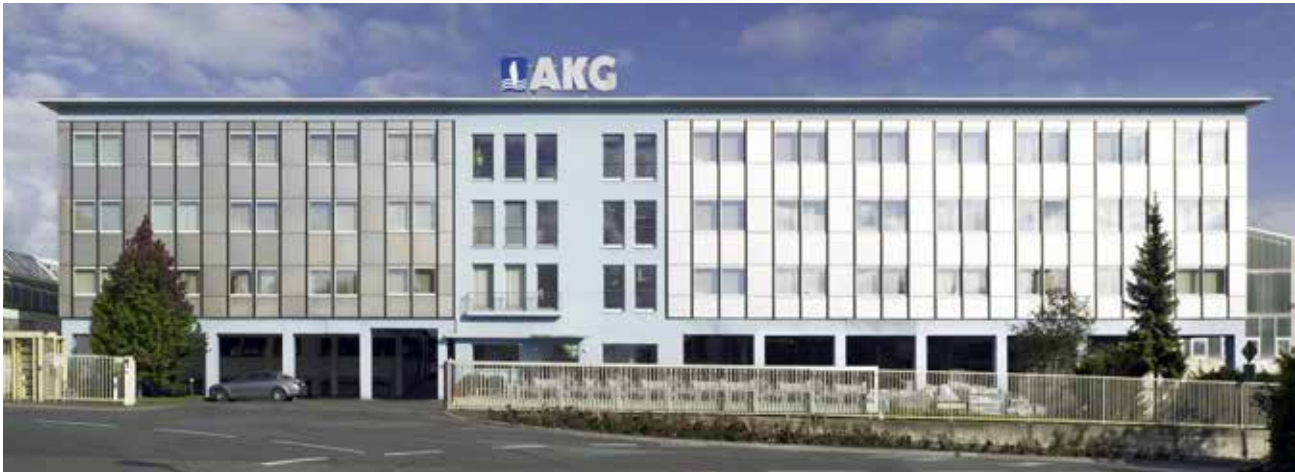
The headquarter of the AKG Group: Autokühler GmbH & Co. KG, AKG Verwaltungsgesellschaft mbH und AKG Thermotechnik International GmbH & Co. KG, Hofgeismar, Germany