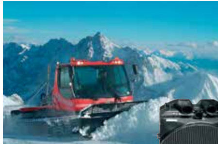
Combination Coolant/Charge-Air Cooler for the special-purpose vehicle „PistenBully 600“, Kässbohrer