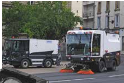
Radiators, Charge-air and Oil Cooler for commercial vehicles