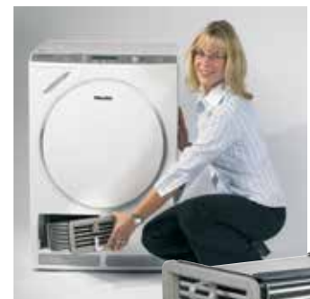
Condenser for a tumble dryer, Miele