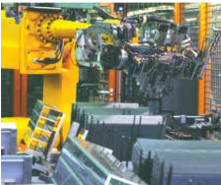
Robot for the assembly of cooling cores

AKG has a strong commitment to protect the environment. The manufacturing organization and all production processes assure minimum waste generation and utilize every recycling opportunity possible. This guarantees that not just economical goals are met, but environmental criteria as well.