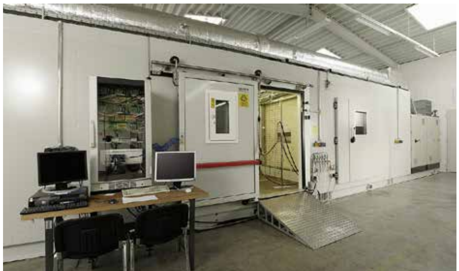
Wind tunnel for performance measurement of large cooling systems

A highly developed testing area allows exacting trials to prove the heat exchanger performance data and strength parameters.