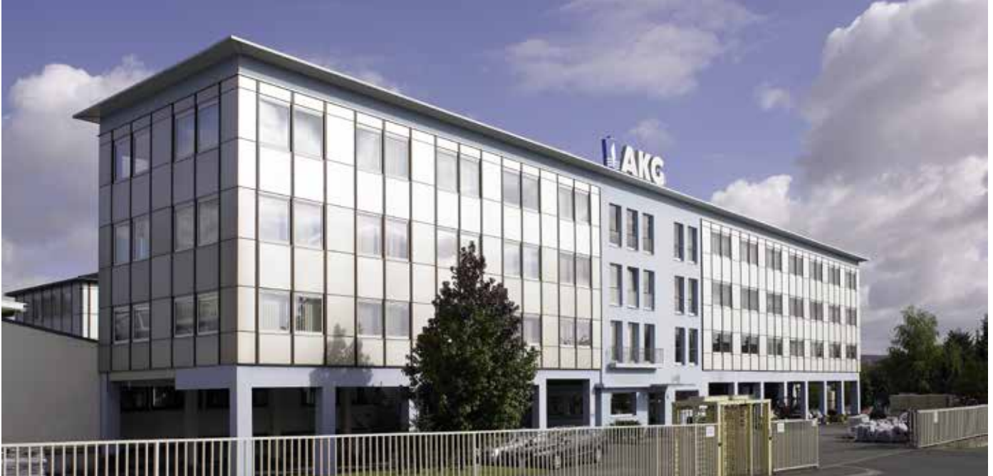
The headquarter of the AKG Group - Hofgeismar, Germany