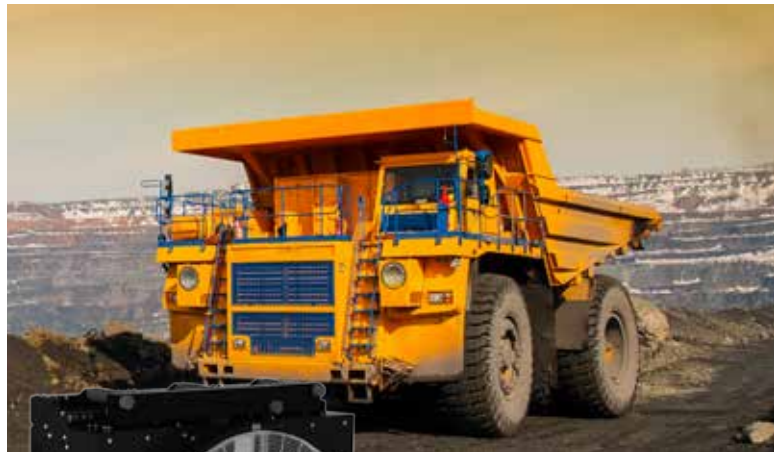
Modular cooling systems for heavy duty applications

AKG has the right solution for each cooling application!