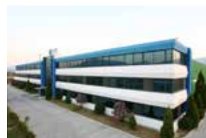
Izmir AKG Termoteknik Sistemler San. ve Tic. Ltd. Şti., Izmir, Turkey