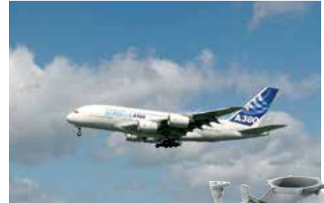
Air Cooler for an Air-Cooling- Unit (AOA Apparatebau Gauting) for food cooling used in the Airbus A380