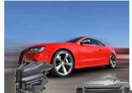
High performance Engine Cooling Module